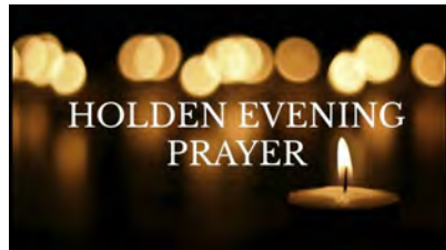
Wednesday, March 15th: 6:00 p.m.