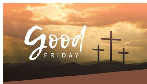
April 7th: 6:00 p.m.