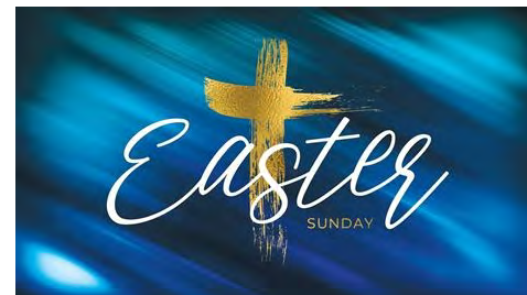
April 9th: 8:00 a.m. garden service 10:00 a.m. traditional service