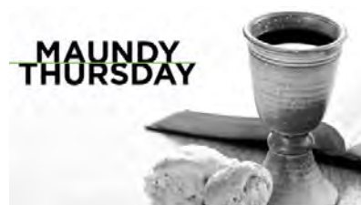
April 6th: 6:00 p.m.